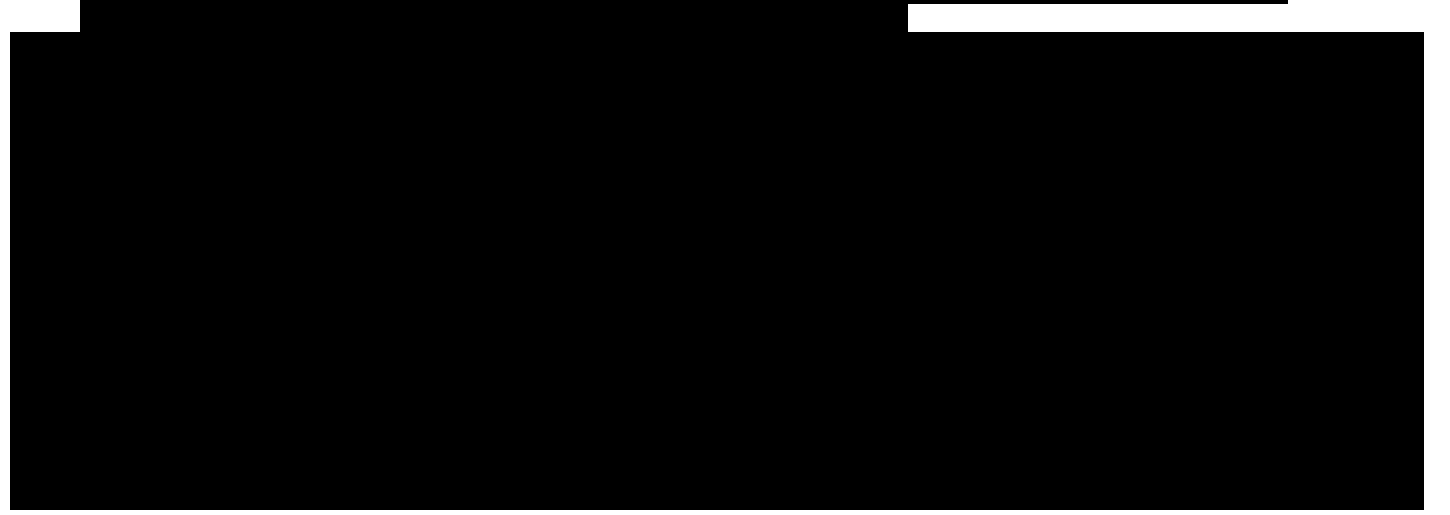
28. In another Tapestry board document, dated March 2022, Coach made it clear that

as well. The parties recognize this range as separate and distinct from mass-market offerings, which typically fall under $100, and true luxury handbags, which have an Indeed, pricing analyses conducted by the parties