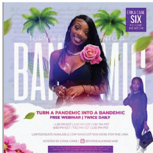
Figure 3: Screenshot of IML Salesperson’s Social Media Posting. 25

The salesperson referred to a “band,” which is slang for $1,000 in cash.