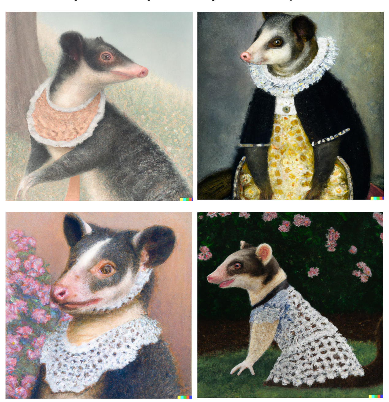
DALL-E rendering of "a possum wearing a white lace collar painted by Georges Seurat"

Here's the good Seurat, and again -- these are passable, but this is just terrible.