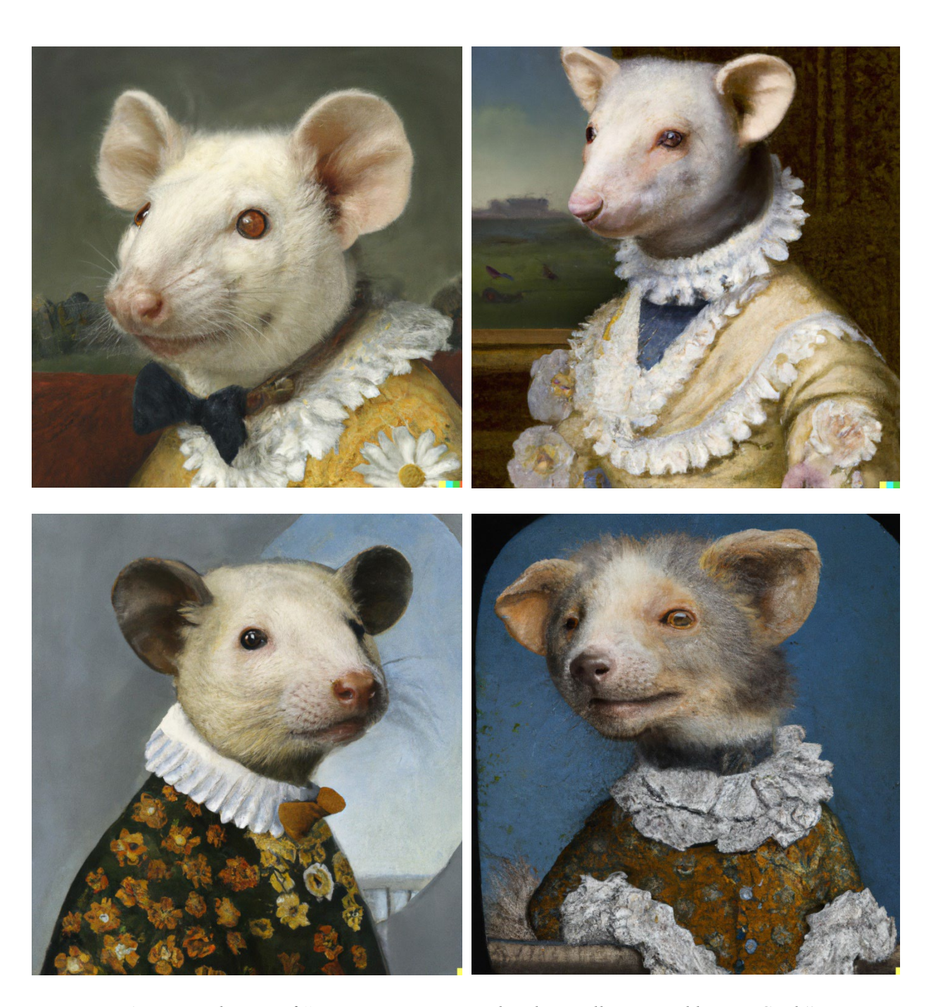
DALL-E renderings of "a possum wearing a white lace collar painted by Van Gogh"

And let's be honest here. If you're an art student, and you turn this [bottom right, above] in for your Van Gogh study... you've got some hard choices ahead of you. That's the first thing: I made the model out to be more than it was by focusing on its optimal performance, not its standard performance.