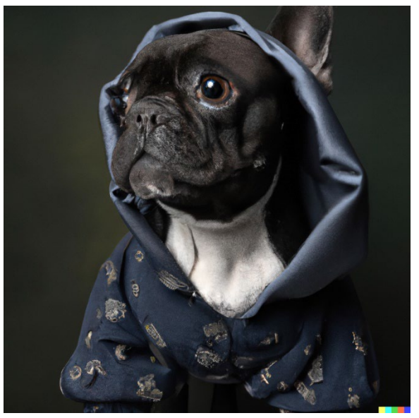
DALL-E rendering of "a brindle French bulldog wearing a while lace collar painted by Holbein the Younger"

So I thought: Maybe the issue is that it's a bulldog. Maybe there are too many images of a bulldog in one pose, and maybe – given the recent popularity of the breed – the vast majority are high-definition photos rather than drawings or paintings. Maybe that unusually uniform training data would skew DALL-E to render the images in a particularly uniform way.