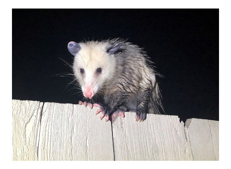
An opossum on top of a fence.

I needed an animal that doesn't have a "good" side – and that's never been a social media darling. So I chose the opossum, a marsupial native to the Americas.