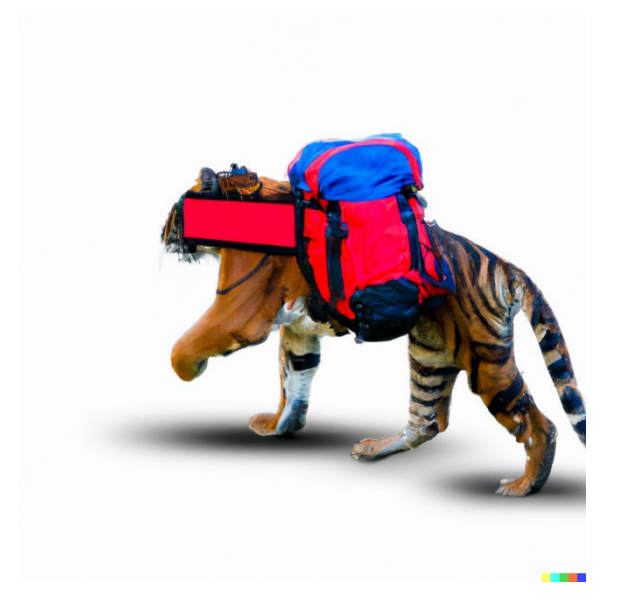
DALL-E renderings of "French bulldog climbing a skyscraper in the clouds" and "a tiger wearing a backpack shooting red lasers"

I suspect most of you have a story about how you discovered generative AI. Here's mine.