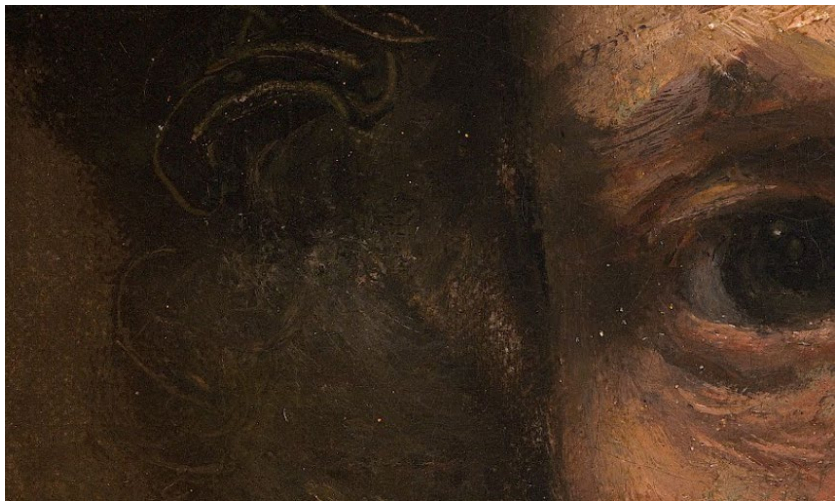
Rembrandt van Rijn, Self-Portrait (1659) & Detail