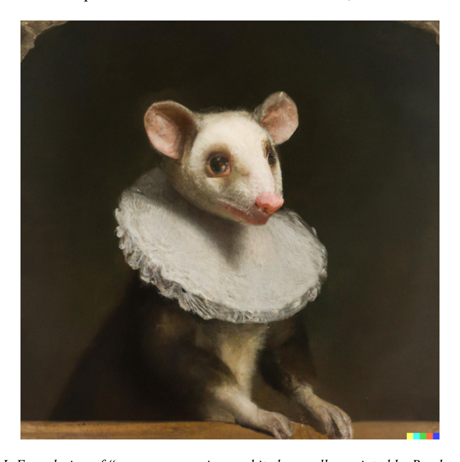
DALL-E rendering of "a possum wearing a white lace collar painted by Rembrandt"

So I rendered the opossum in that formal white collar. First, in Rembrandt. And I got this.