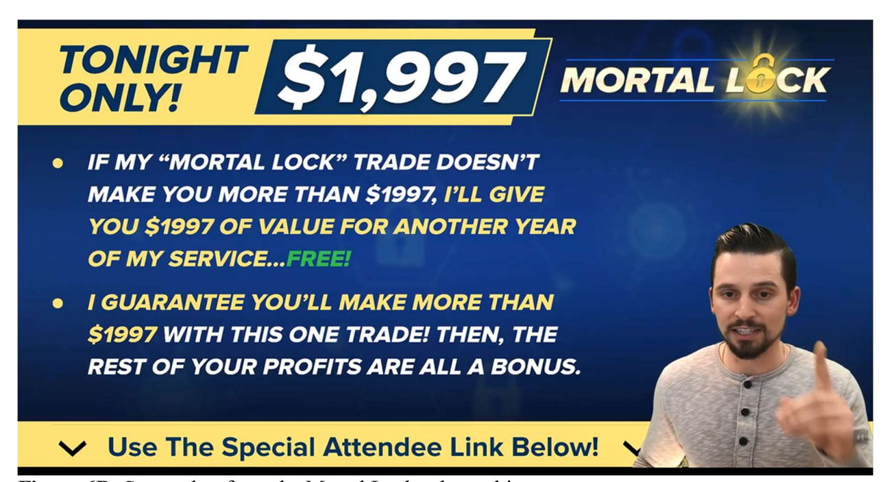
Figure 6B: Screenshot from the Mortal Lock sales webinar

57. Dennis then claims that consumers who sign up now for this service will get access to his "Mortal Lock" trade alerts, which have the potential to generate "500, 600, 1,000, 2,000 percent" returns, and that Dennis has "hundreds" of trade alerts with the potential to generate 1000% or more in trading profits. Dennis also "guarantees" that his Mortal Lock trades will generate at least $1997 in trading profits on a single trade (approximately a 400% return on a $500 investment), as illustrated in Figure 6B below: