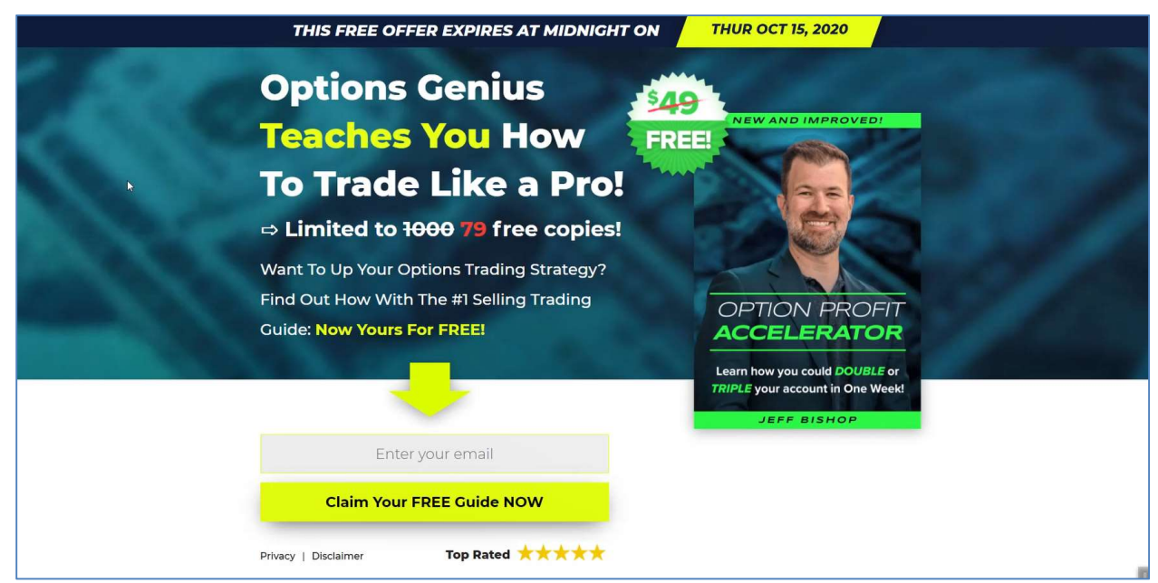
Figure 2: Screenshot of webinar offered on one of Defendants' marketing websites, arrived at by clicking the ad shown in Figure 1 , supra .

34. After consumers click one of these ads, they are typically taken to the website for a specific product. Most of these sites have a similar design and feature further advertising for the specific product. In many cases, the site will pitch some introductory content such as a webinar or e-book, as illustrated below in Figure 2 (stating "Learn how you could DOUBLE or TRIPLE your account in One Week!"). These webinars and e-books provide some basic educational content but serve primarily to advertise Raging Bull's products.