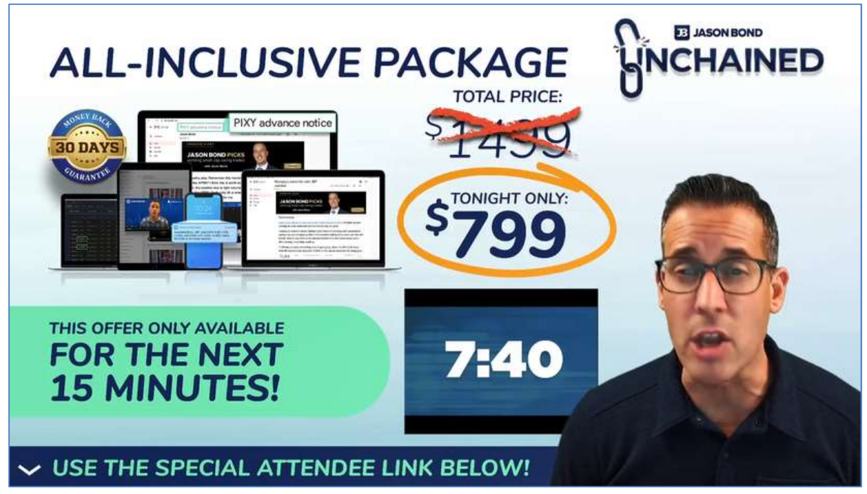
Figure 3: Screenshot from Jason Bond Unchained promotional webinar.

provides an overview of the purported strategy behind the product, often while sharing consumer testimonials or touting successful trades. The videos typically discuss details about the particular Raging Bull service and how to purchase it. In many cases, the free webinar videos end by describing a purported limited-time offer to get the advertised product at a discount, as illustrated below in Figure 3 . Many of the products' web pages also assert limited-time deals.