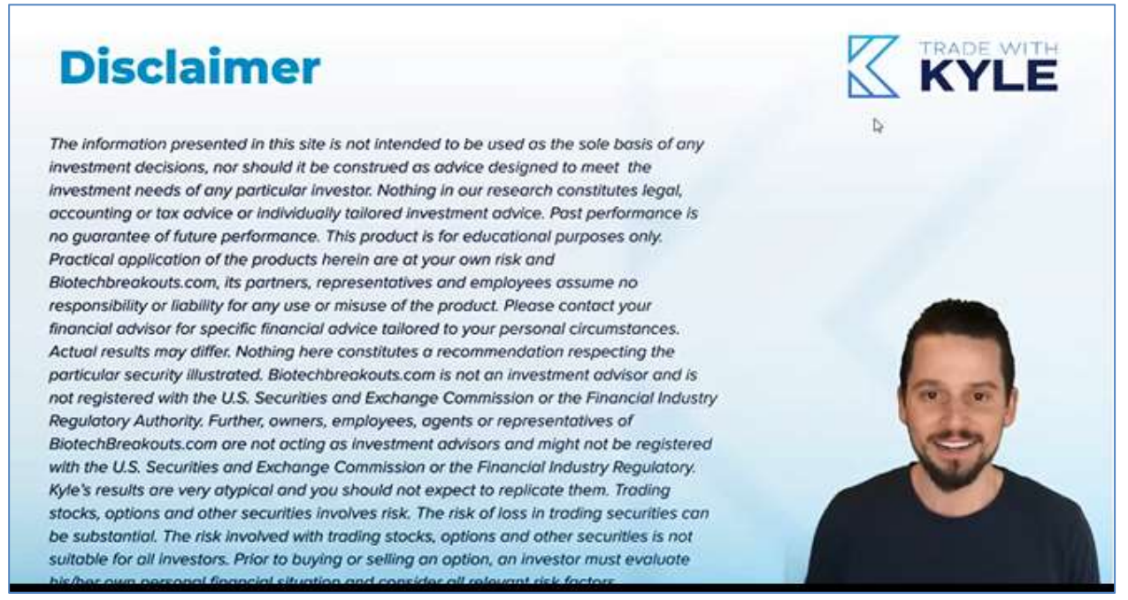
Figure 9 : Screenshot of disclaimer text displaying at the beginning of a Trade With Kyle promotional video.

includes a brief disclaimer at the beginning of the video for approximately 30 seconds, about 15 minutes prior to Dennis sharing his example wins and consumer testimonials.