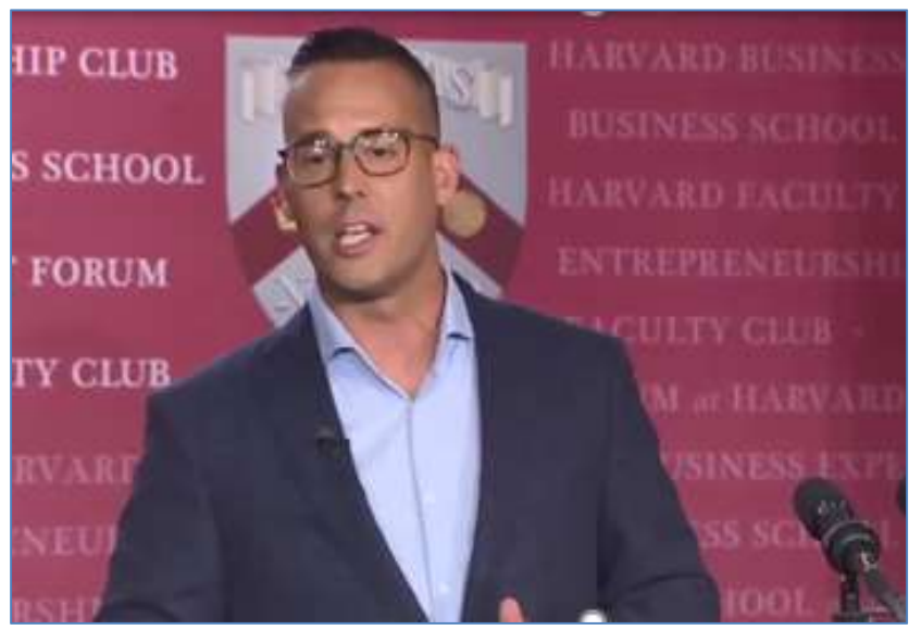
Figure 5: Screenshot from recording of Bond's purported Harvard Business School speech.

Business School or feature a video of him supposedly doing so. A screenshot of a recording of Bond's purported Harvard speech is shown below in Figure 5 .