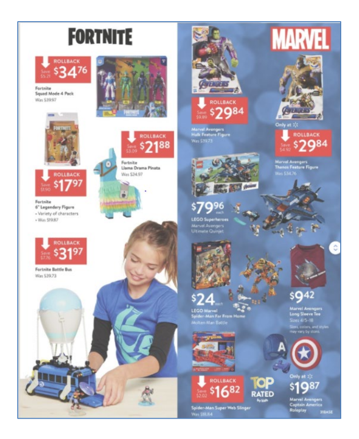
27. Notably, a toy from the Epic-Jazwares partnership—the Fortnite Llama Loot Pinata—tied with Lego's Harry Potter products to win the "Toys / Games / Novelties for Ages 0-12" category at the 2019 International Licensing Awards. As the head of Epic's consumer products program explained internally, Epic won the "Newcomer" award that year after Fortnite or Fortnite-branded products won first place awards in five categories—despite being "up against some heavy hitters like Harry Potter, Jurassic World, and Lego."

28. By the first half of 2020, Epic's consumer products program had generated more than $1 billion in gross sales of Fortnite-branded merchandise, bringing more than $130 million in gross royalties to Epic and its licensing agent. Most of this success was