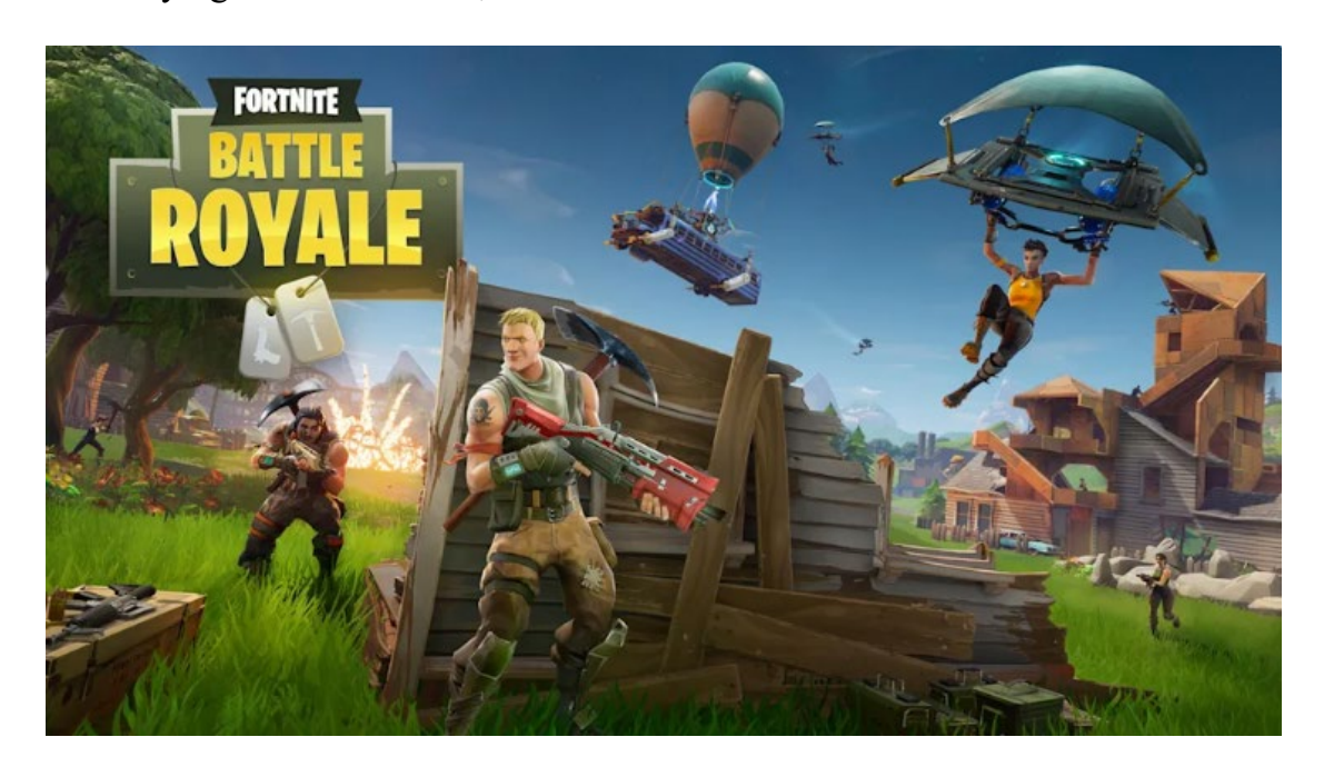
19. Akin to digital laser tag, there is no blood or gore in Fortnite, and players are "eliminated" from the game (not "killed").

virtual world (e.g., "Loot Lake," "Tilted Towers," "Retail Row") after jumping from a whimsical flying blue school bus, called the "Battle Bus."