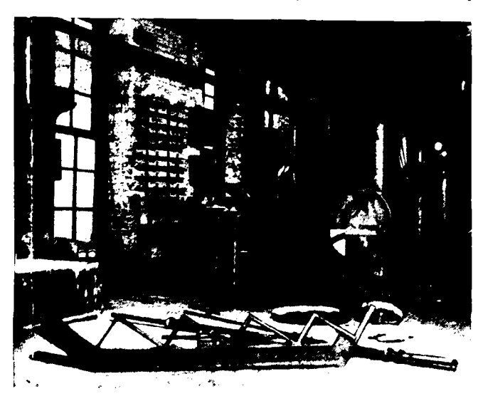
A Good Welding Shop Without Elaborate Equipment. At right is oxy-acetylene equipment on a hand truck; another set is at the welding table in center; on wall in welding rod rack and at left is lime bin for annealing castings. In foreground is a variety of work done on steel, iron and alloys

T is frequently found that in plants which have had a cutting and welding outfit for a long time no clear idea is had of the maximum usefulness of the oxy-acetylene process. Thus a sheet metal company might purchase equipment to oxweld a particular lot of tanks and fail to realize, when a brake frame cracks, that there is already