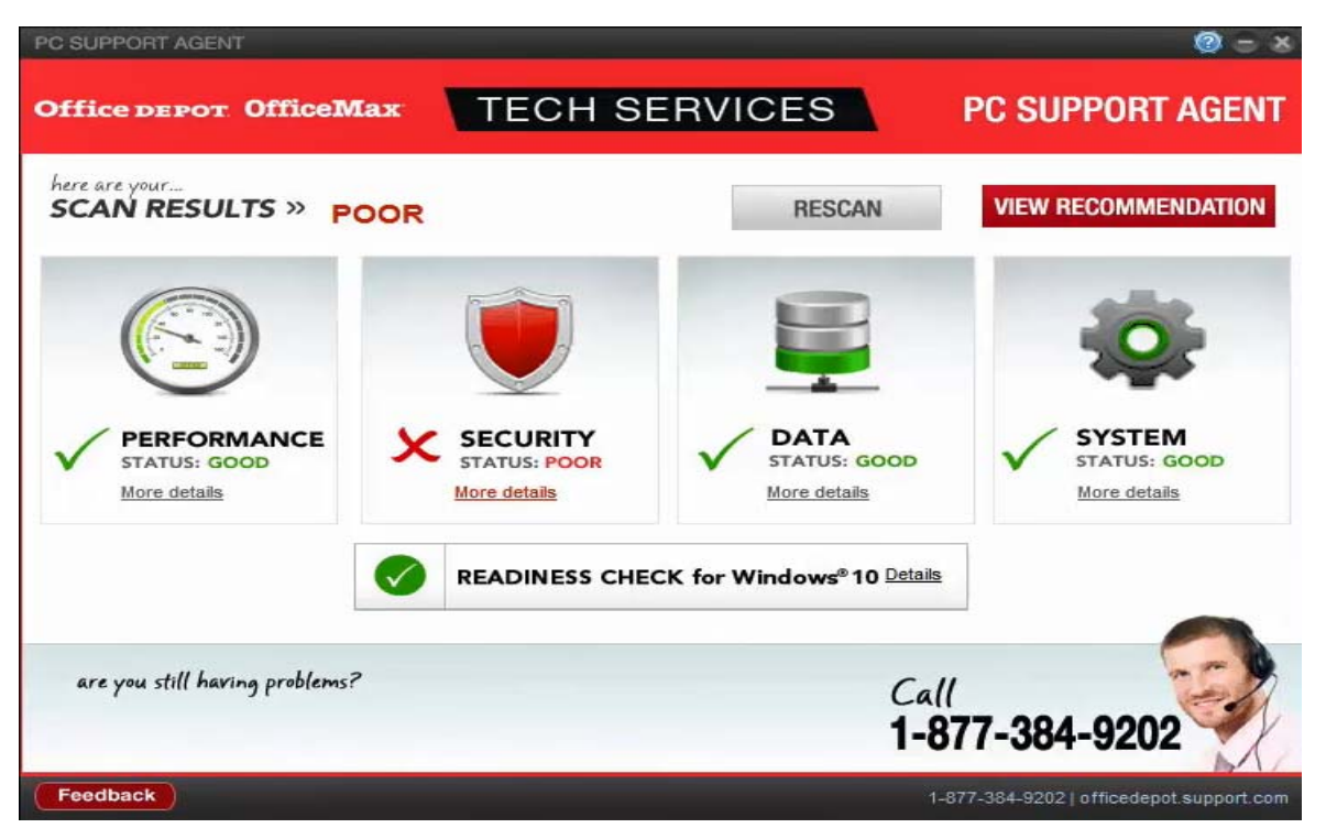
Figure 4: PC Health Check Program final scan results page (2016 in-store version)