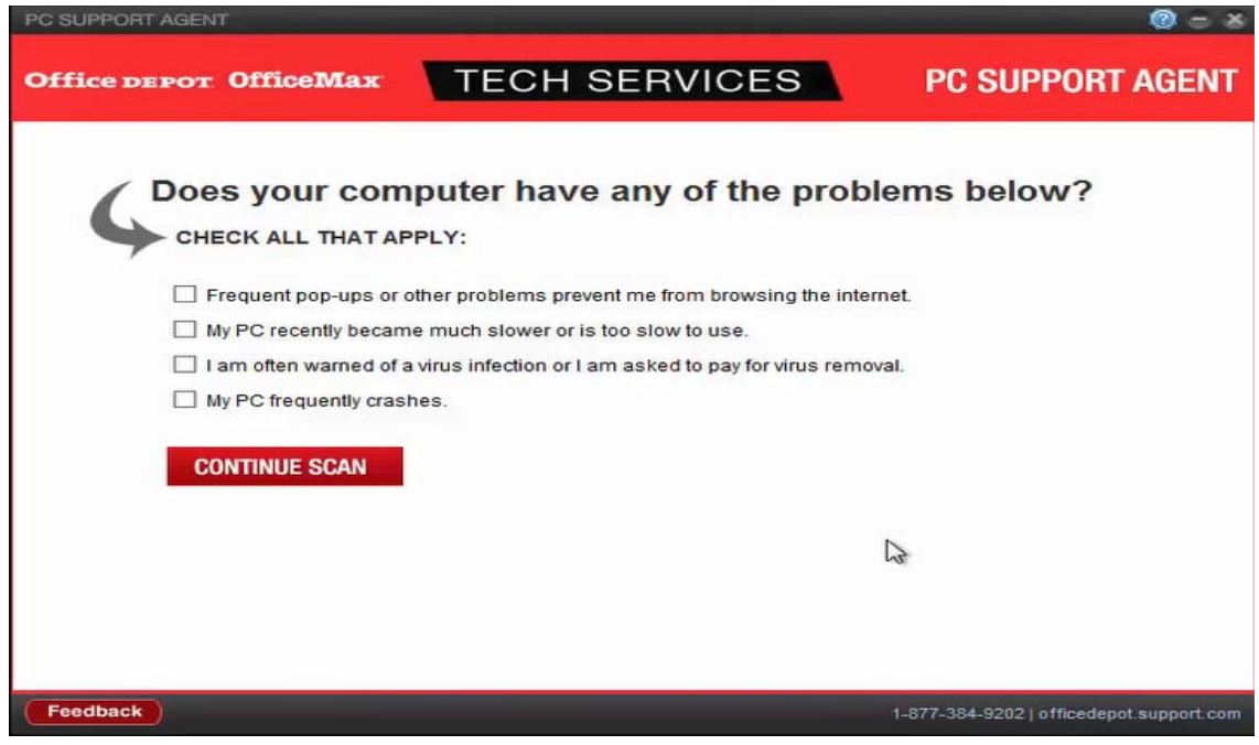
Figure 1: PC Health Check Program initial screen (2016 in-store version)