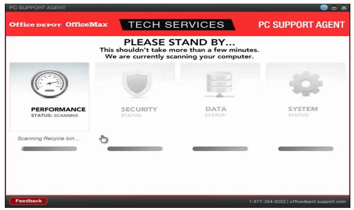
Figure 2: PC Health Check Program scanning screen (2016 in-store version)

security (represented by a shield icon), data (represented by a meter icon), and system (represented by a gear icon).