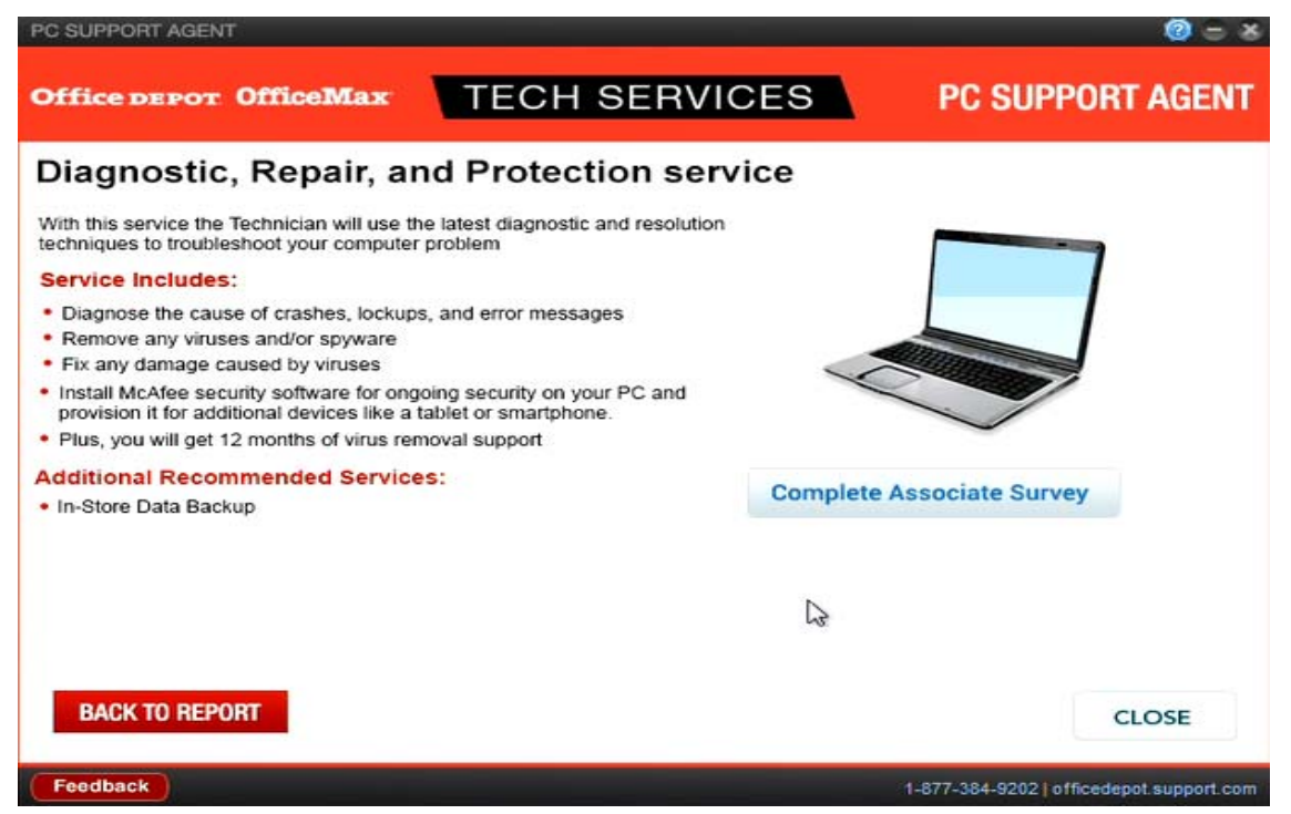
Figure 5: PC Health Check Program Service Recommendation Page (2016 in-store version)