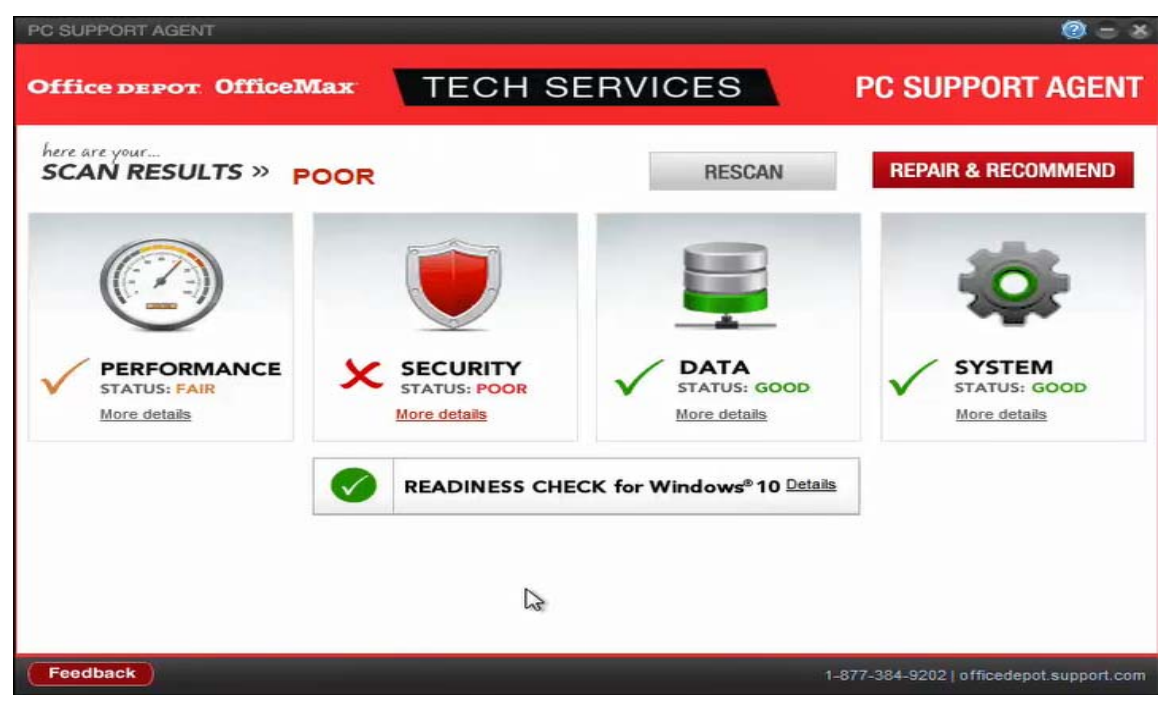
Figure 3: PC Health Check Program initial scan results screen (2016 in-store version)

39. In addition to displaying the terms "poor," "fair," or "good," the status of each category was also reflected through the use of colors and either a checkmark or an "X." A status of "poor" resulted in a red "X" with the word "poor" also rendered in red, a "fair" status resulted in a yellow checkmark with the word "fair" rendered in yellow, and a status of "good" resulted in a green checkmark with the word "good" rendered in green. Additionally, the icons representing each category were shaded with the color corresponding to the status. For example, the PC Health Check Program displayed the shield representing "security" in red if the security status was "poor" or green if it was "good."