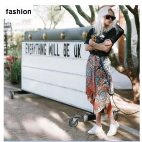
this season's musthave line