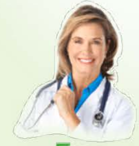
Free Weight Loss Consultations With expert nurses

If you are approaching or already going through menopause and struggling with weight gain, there is no alternative to Amberen. In a double blind, placebo controlled clinical study, women who received Amberen showed consistent and statistically significant weight loss without significant changes in their lifestyle.