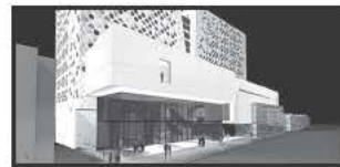
A randomized, double-blind, placebo-controlled study on what may be the world's first truly effective memory pill was conducted at this university research facility.

blood circulation to the brain and increases the key neurotransmitters that are responsible for cognitive functioning."