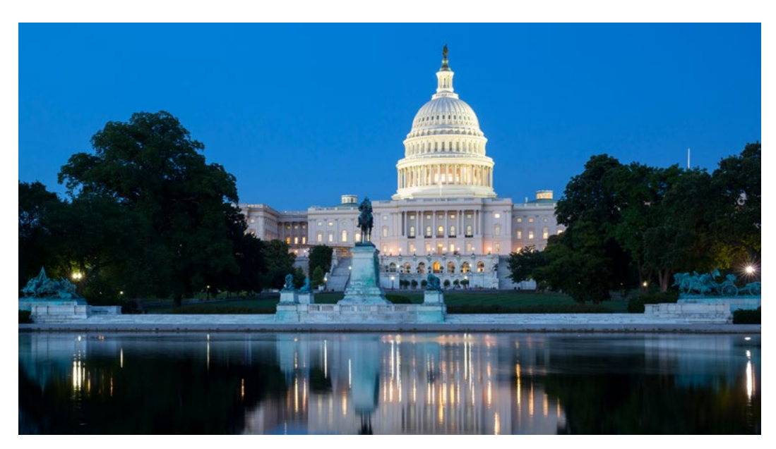
West Front of the U.S. Capitol Building, Washington, D.C.

Offices of Inspector General (OIGs) are located within their agencies but must conduct their audits, investigations, evaluations, and special reviews independently from their agencies. For example, agency heads may not prevent the IGs from