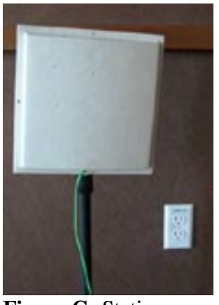
Figure C. Stationary reader