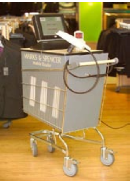
Figure D. Mobile reader