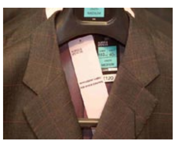
Figure B. RFID hang-tag

• The reader, or scanning device, also has its own antenna, which it uses to communicate with the tag. 14 Readers vary in size, weight, and power, and may be mobile or stationary. Although anyone with access to the proper reader can scan an RFID tag, 15 RFID systems can employ authentication and encryption to prevent unauthorized reading of data. 16 "Reading" tags refers to the communication between the tag and reader via radio waves operating at a certain frequency. In contrast to bar codes, one of RFID's principal distinctions is tags and readers can communicate with each other without being in each other's line-of-sight. 17 Therefore, a reader can scan a tag without physically "seeing" it. Further, RFID readers can process multiple items at one time, resulting in a much-increased (again as compared to UPC codes) "speed of read." 18