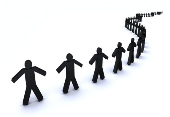
The fundamental flaw in MLM is the <u>endless chain</u> <u>of recruitment</u> of participants as primary customers. MLM pay plans assume infinite markets and virgin markets – neither of which exists in the real world.

consistent pattern of pay plans that are recruitment-driven and top-weighted, meaning they are driven by incentives to recruit, with company payout of commissions going primarily to founders and a select few "TOPPs" (top-of-the pyramid promoters) who are usually those who were positioned at the beginning of the recruitment chain.