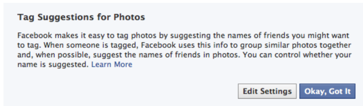
FIGURE 2: Facebook notice for facial recognition tagging technology (January 27, 2012).

photo uploading system and entirely fails at informing users how their photo data will be used or to provide any meaningful consent for use..