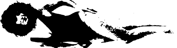
"Ahora he recuperado una línea de jessicita, ya no tengo ninguna inseguridad y estoy orgullosa de mí misma. Ahora habiéndome creído que fuera un caso para adelgazar, ¡sorpresa una...!"

Sigui, porque era realmente fácil y muy agradable. Después de cada sesión de NutraTrim experimentaba la misma sensación deliciosa de bienestar... además, tanta la facilidad de ver como la agude del peso se inclinaba hacia la izquierda. Al mismo tiempo, veía mi línea afilada, recordarme regímenes y las privaciones, como todo lo que quería y adelgaza a simple vista. ¡Ingeniería, había perdido diez libras la primera semana!... En