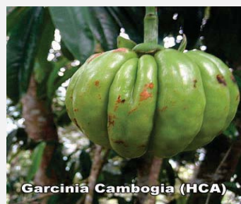
Garcinia Cambogia (HCA)

We were pretty skeptical, but wanted to find out for ourselves if this product could actually do everything that it claimed. Most of the success stories talk about combining HCA with colon cleansing products to achieve maximum weight loss. I decided to do the same. The idea behind combining the products is that while the HCA encourages weight loss and increases energy, the colon cleanse helps rid your body of toxins and allows your body to work and burn calories more efficiently. I chose LeanSpa Cleanse to test.