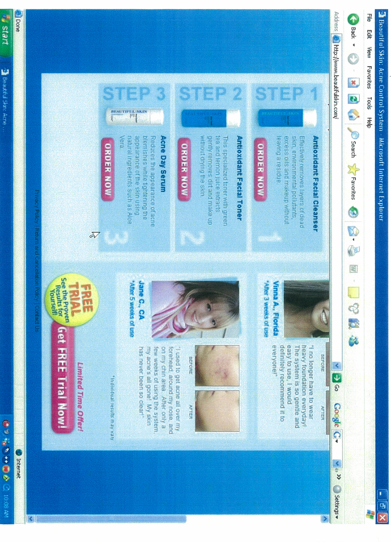
Exhibit C -Page 2