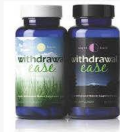
Withdrawal Ease Daytime and Nighttime Formulations

A more comfortable and affordable way to detox at home