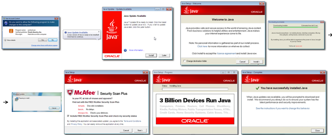
Exhibit B - Windows Java SE version 7 update 9 Update Flow (released by Oracle on October 16, 2012)