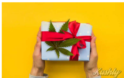
5 Rules For Buying A Quality CBD Product