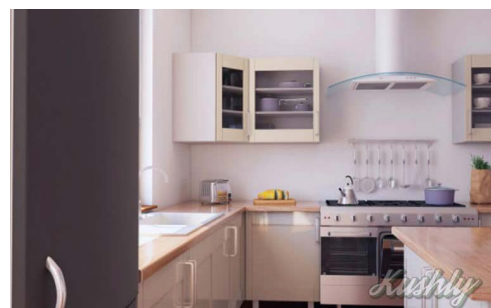
The Best Way To Keep CBD Edibles Fresh And Tasty