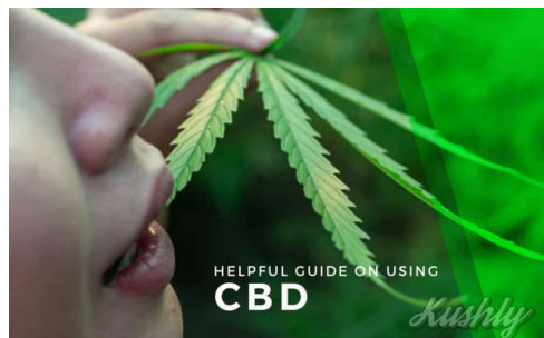
A Helpful Guide On Using CBD