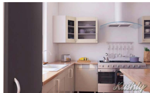
The Best Way To Keep CBD Edibles Fresh And Tasty