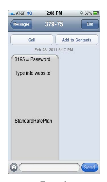
Top of Message