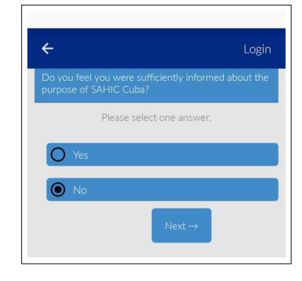
Fig. 4. Example screenshots collected by TestFairy. Left: Contact info. Center: Messaging another user. Right: Responses to a survey.

code does not guarantee it will ever be executed. To address this, we used dynamic analysis to filter out false positives. However, this does not address false negatives (where media API calls are reachable, but our automated interaction tool does not trigger them).