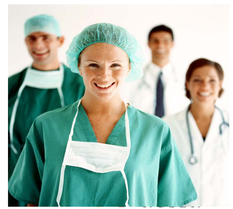
National Council of State Boards of Nursing