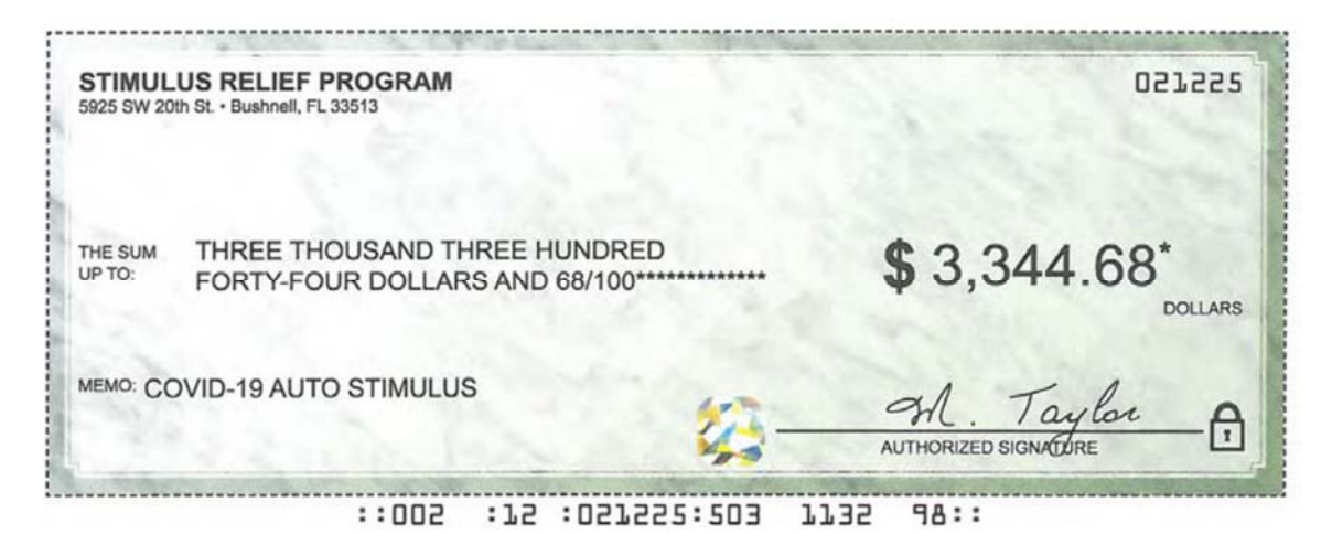
(Exhibit C, copy of the purported check contained in mailer)

10. Respondents disseminated a similar "TIME-SENSITIVE" mailer purporting to contain "IMPORTANT COVID-19 ECONOMIC STIMULUS DOCUMENTS" to entice consumers to a Chrysler Dodge dealership in Dothan, Alabama (Exhibit D).