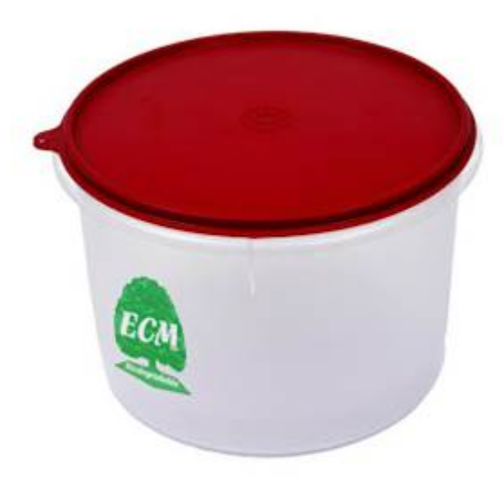
(3H) What is your best estimate of the amount of time it would take this container to biodegrade?