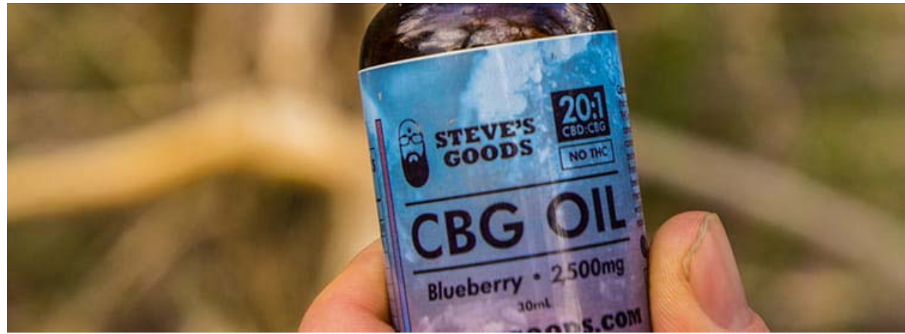
Steve's Goods Blueberry flavored CBG Oil (30mL, 2500mg bottle)

Cannabigerol is the chemical mother of all other cannabinoids. Hemp & marijuana plants produce it naturally in the form of cannabigerolic acid, but it is considered to be a minor cannabinoid in lieu of the fact that it appears in low readings on lab tests of mature cannabis plants. The major cause of this? Most CBG is immediately converted into one of the other major cannabinoids during photosynthesis. That means it is not plentiful, and that it takes a lot of cannabis to isolate or distill a considerable amount of CBG, making it expensive to come by. In bulk, it can be obtained in the form of isolate powder, and in the form of distillate liquid (more to come on those later).