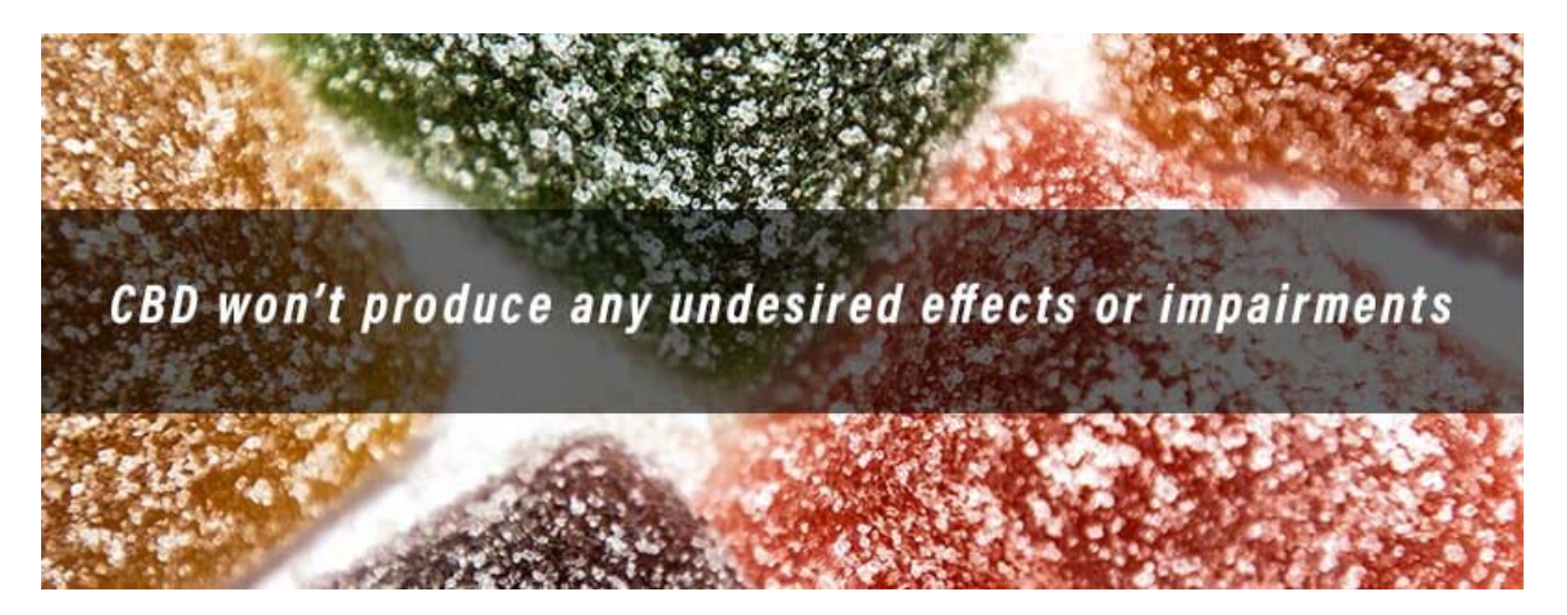
Are CBD Edibles A Passing Fad? Consistency Is the Key to Results

Over the last decade, fad diets, exercise regimens, and other health crazes have become common fixtures in our daily lives. In fact, considering the naturally occurring terpenes in CBD, it helps to interpret how they can complement the natural compounds and attributes of foods we eat every day. Creating a healthy meal plan can require discipline and dedication to fully experience the rewards of feeling healthier in addition to paying for expensive meal prep. Adding CBD edibles products to your daily routine can be unbelievably easy to adhere to and readily accessible to everyone – without prior knowledge or experience to try out.