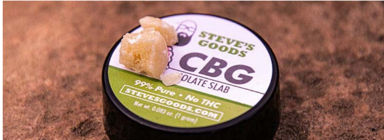
Steve's Goods CBG Isolate Slab

Though we anticipate a wave of high-CBG flower strains emerging to satisfy demand from the market, there are few to no such strands in circulation presently. Again, cannabigerol is almost always biosynthesized into another cannabinoid while plants grow and flower, meaning someone would have to interrupt such biosynthesis to retain the maximum levels of CBG produced by a particular strain or plant. That is not to say CBG cannot be attained in bulk volume. Steve's Goods deals in three major bulk forms of CBG: <u>CBG isolate powder</u>, <u>CBG distillate</u>, and <u>CBG oils</u> and tinctures.