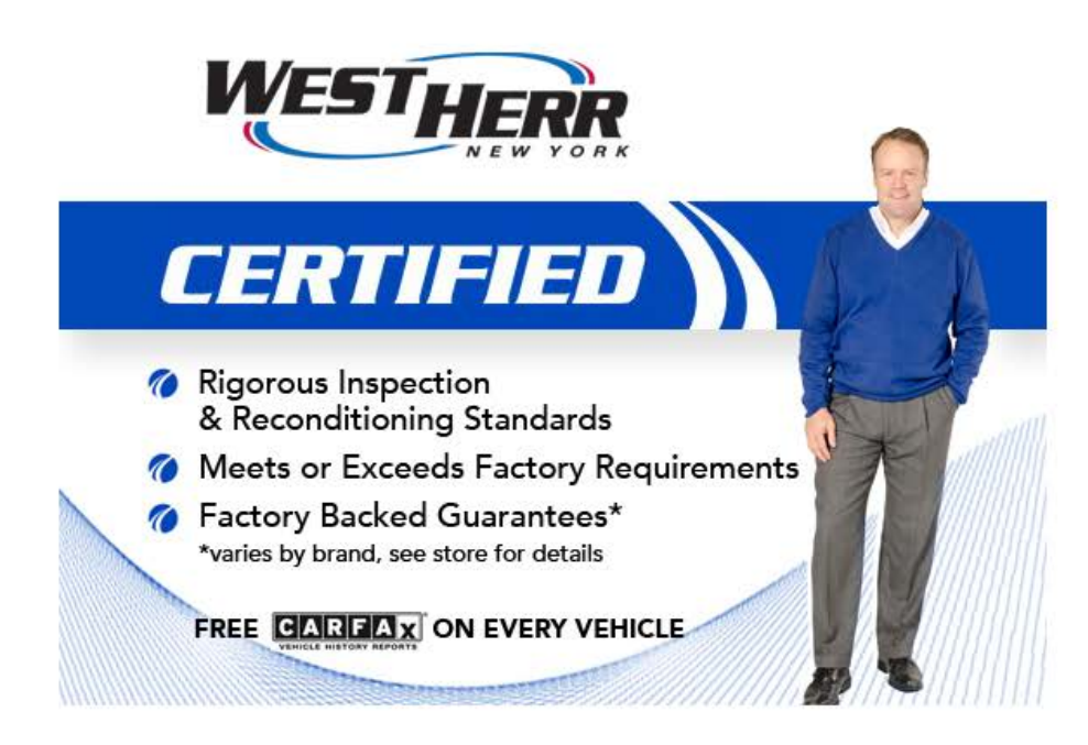
Exhibit B, Page 3