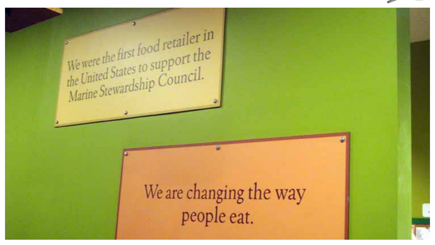
Signs in a New York grocery store.

inquiry into the collapse of the resource. ki (Several weeks later, a once-in-a-century run of over 25 million fish returned to the Fraser River, perhaps smoothing over what might have otherwise remained an extremely controversial certification). kii