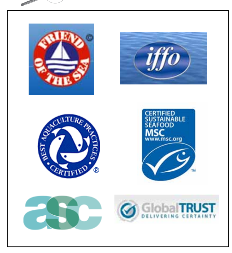
Various logos used in fish certification programs

USDA "organic" certification does not yet apply to fish, but the agency is currently discussing proposed standards, which are highly controversial. The label applies only to farmed fish, not wild-caught, even though many people feel wild fish is often a preferable seafood option. This makes the label confusing for consumers, as many people feel "organic" is an indicator of higher quality.