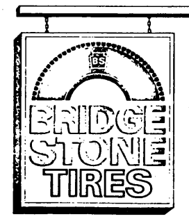
Check the Yellow Pages for your local Bridgestone Tire Dealer.

combination of resilient fabric plies with girdling steel belts provides a rare degree of long-run security and comfort. Among 3,200 types of Bridgestone tires do we build the best radial in America? You be the judge. Visit your Bridgestone dealer today.