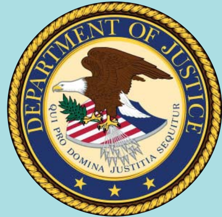
DEPARTMENT OF JUSTICE ANTITRUST DIVISION