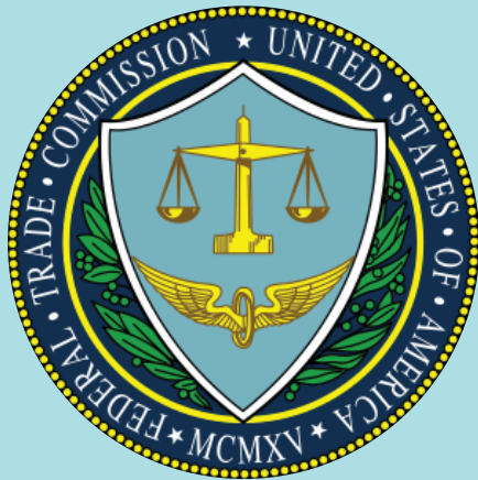
FEDERAL TRADE COMMISSION BUREAU OF COMPETITION